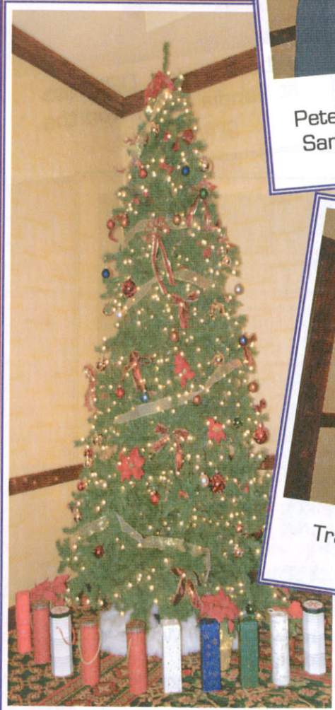
Holiday Tree at the 2007 ORION Holiday Party.